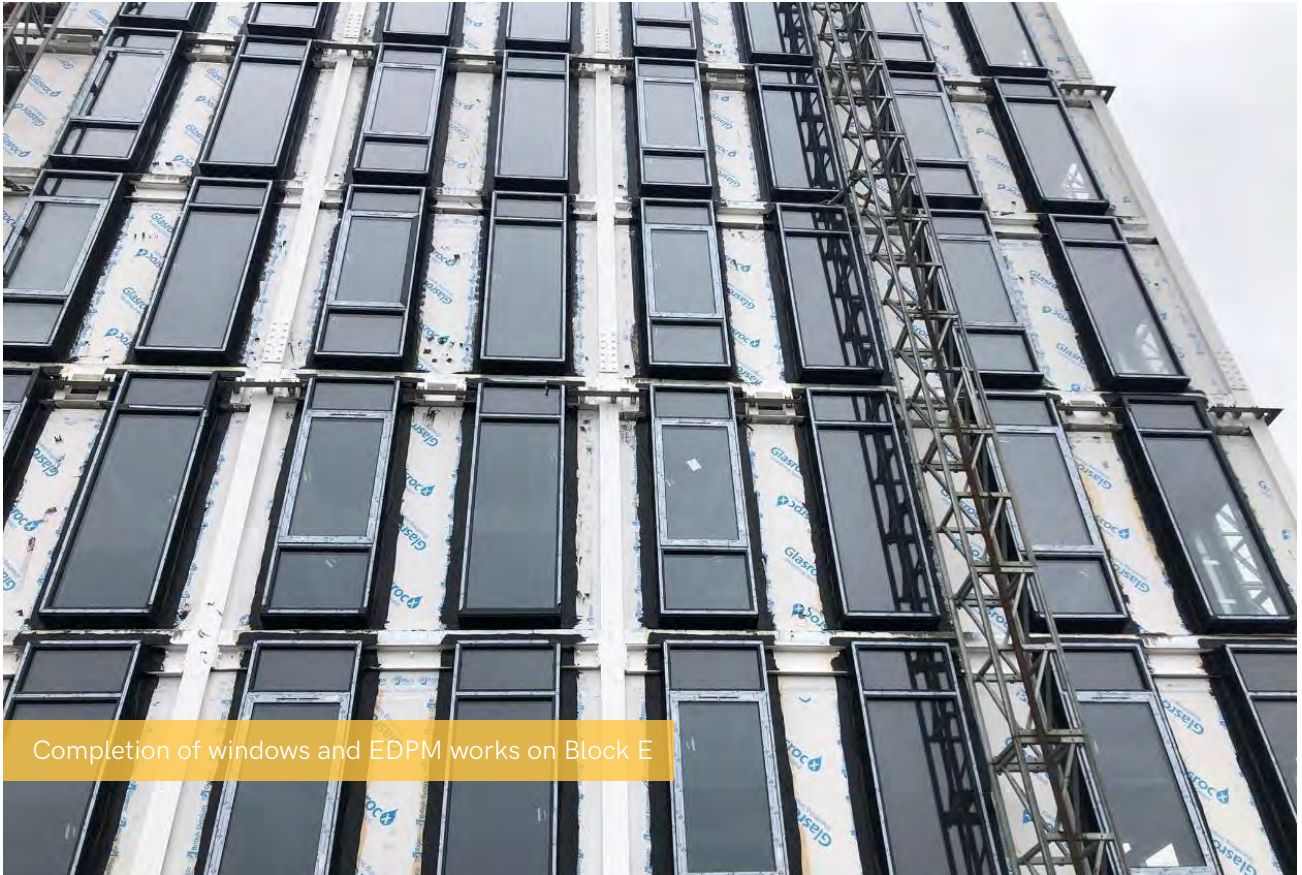
Completion of windows and EDPM works on Block E