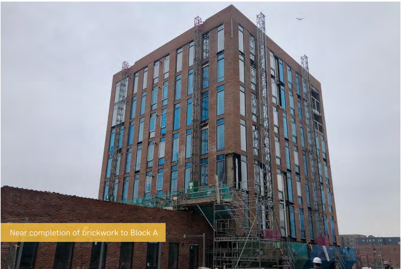
Near completion of brickwork to Block A