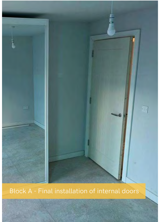
Block A - Final installation of internal doors