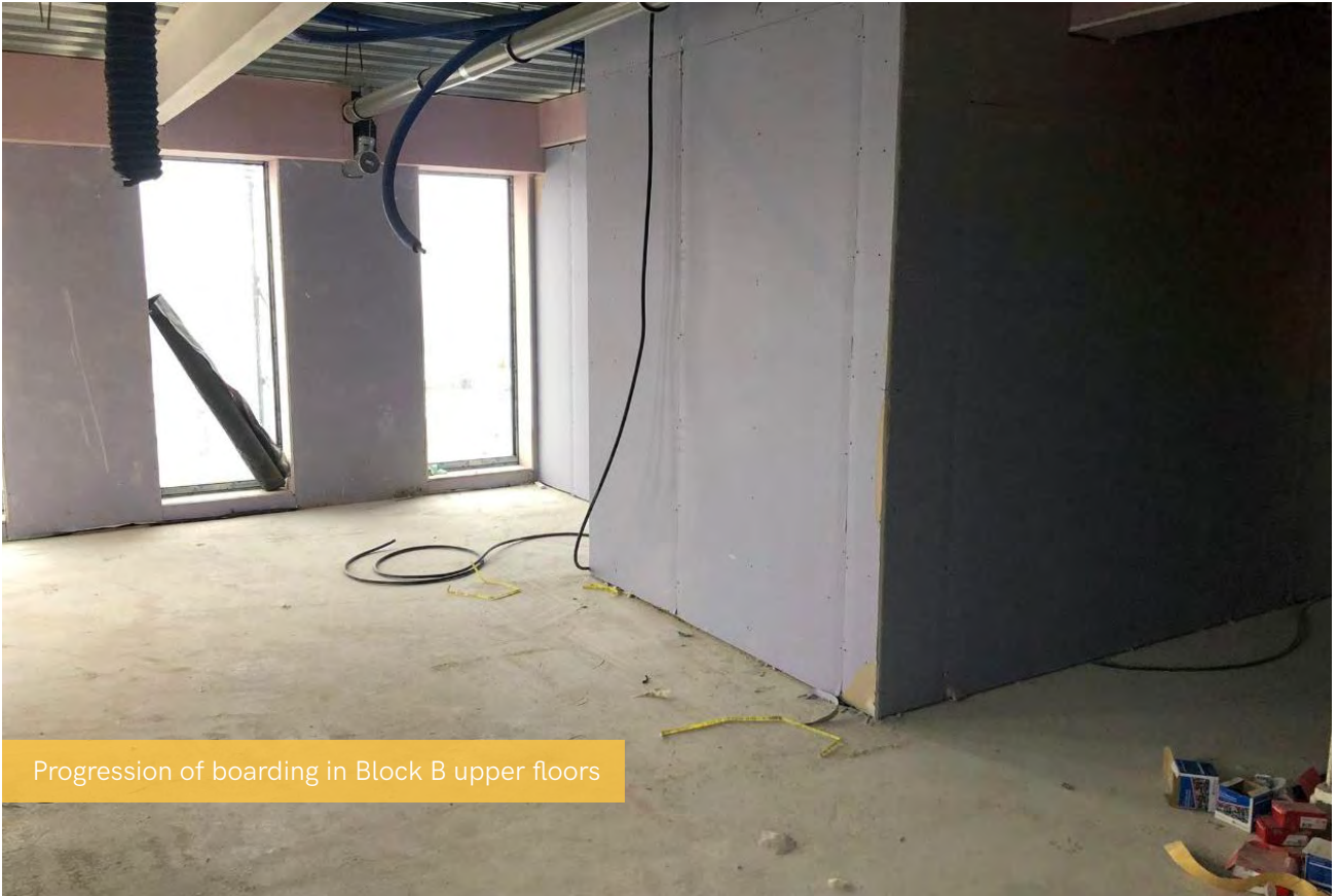
Progression of boarding in Block B upper floors