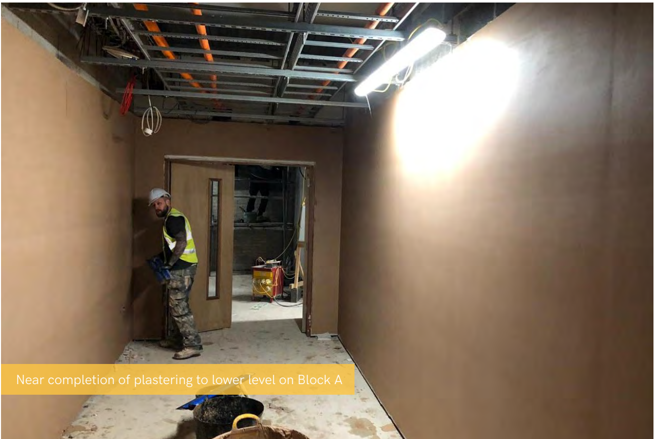
Near completion of plastering to lower level on Block A