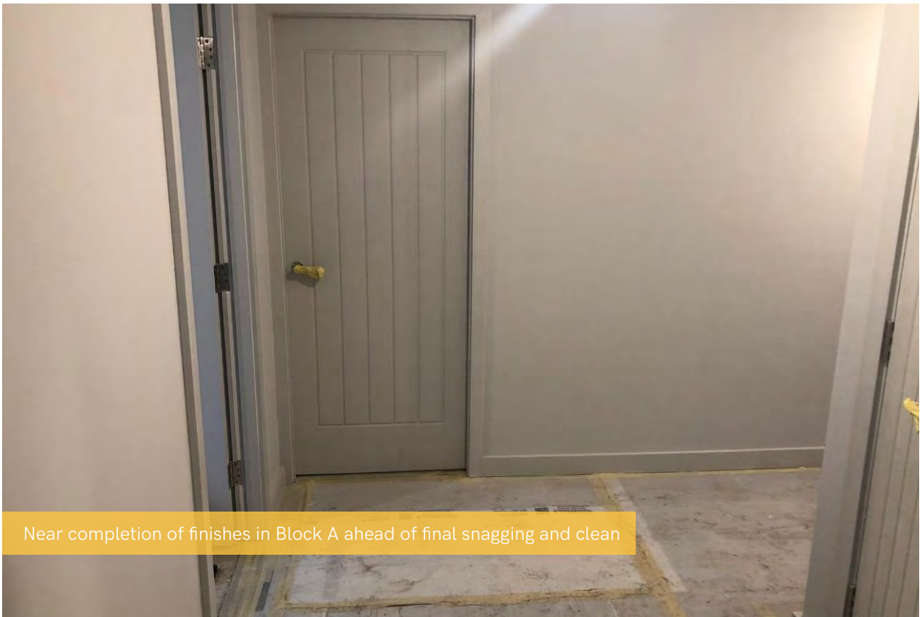
Near completion of finishes in Block A ahead of final snagging and clean