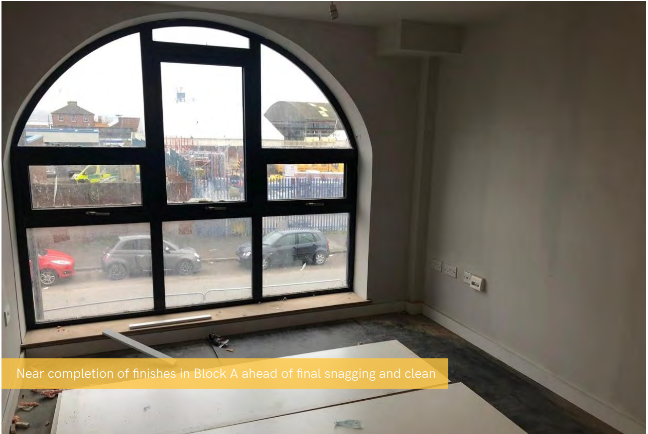
Near completion of finishes in Block A ahead of final snagging and clean