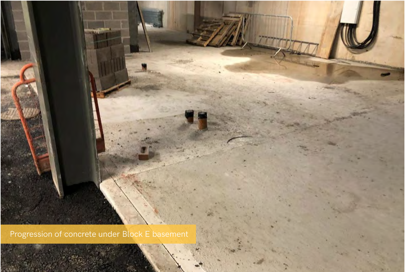
Progression of concrete under Block E basement