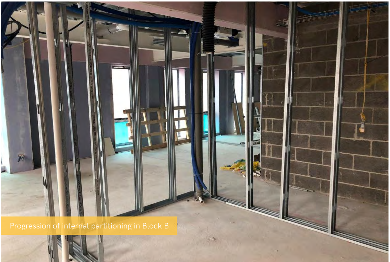
Progression of internal partitioning in Block B