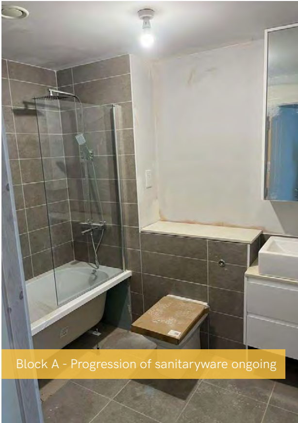
Block A - Progression of sanitaryware ongoing