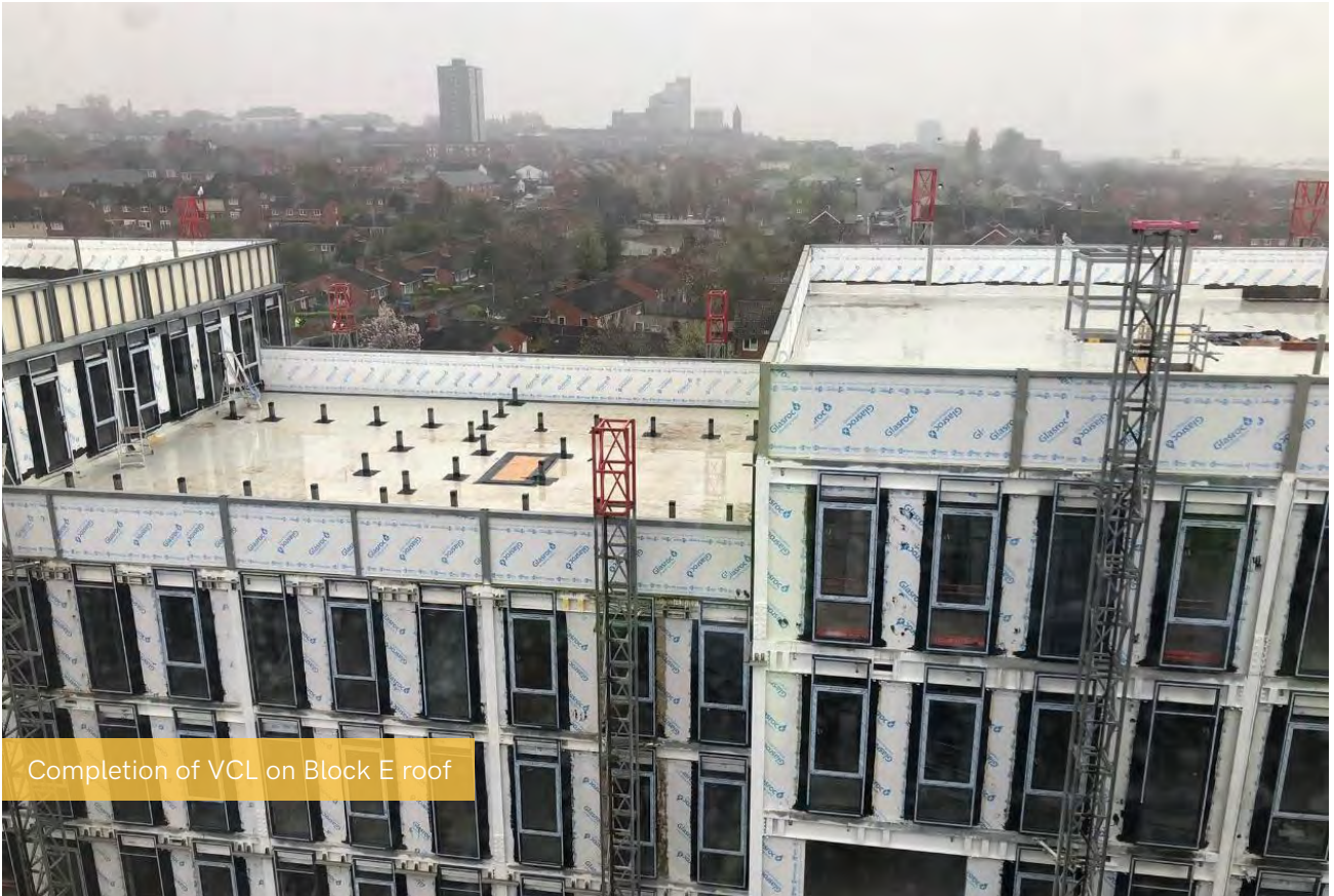
Completion of VCL on Block E roof