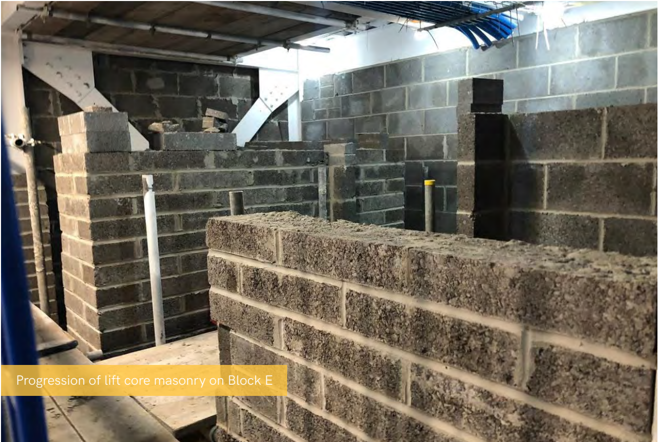
Progression of lift core masonry on Block E