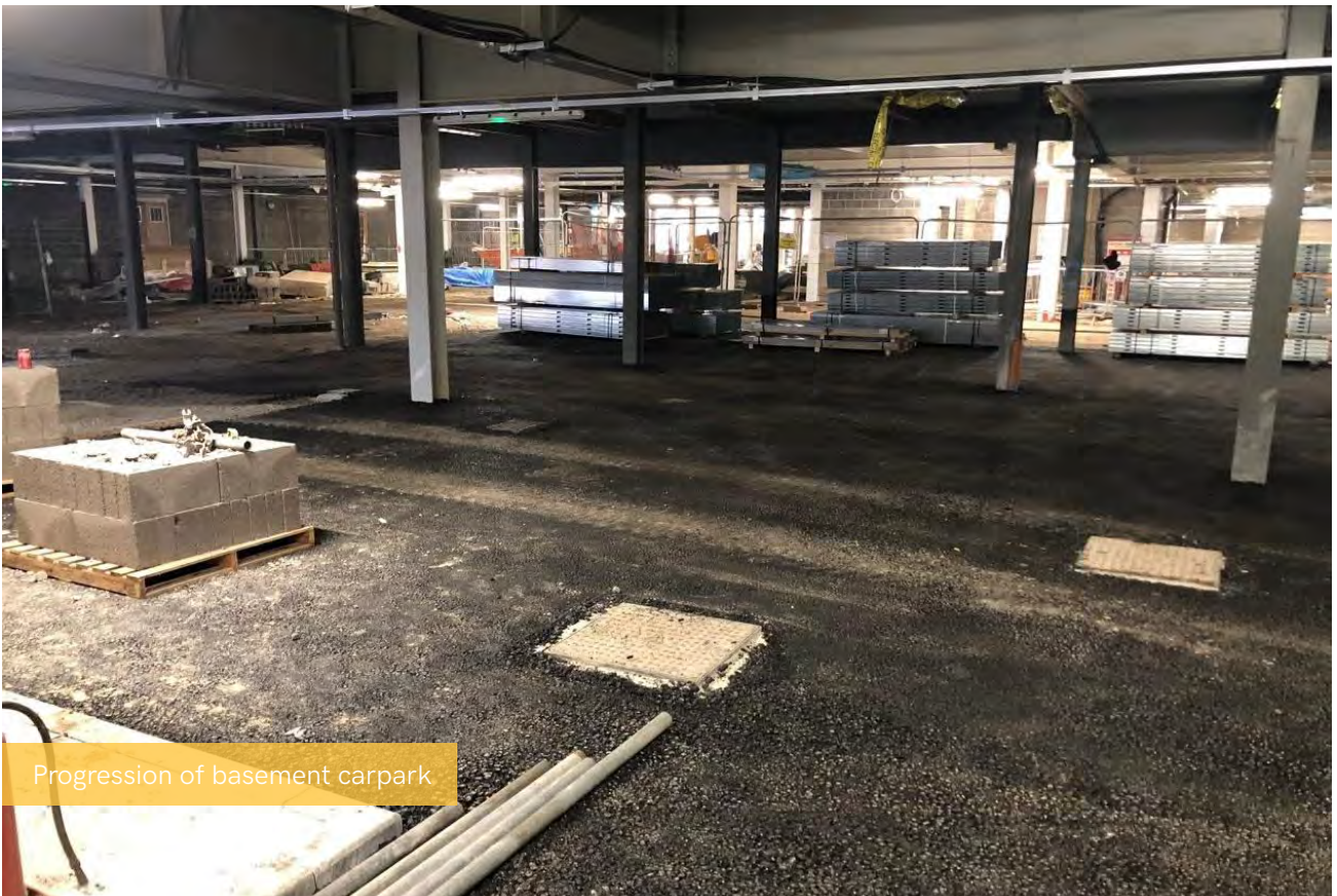
Progression of basement carpark