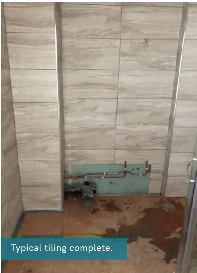
Typical tiling complete.