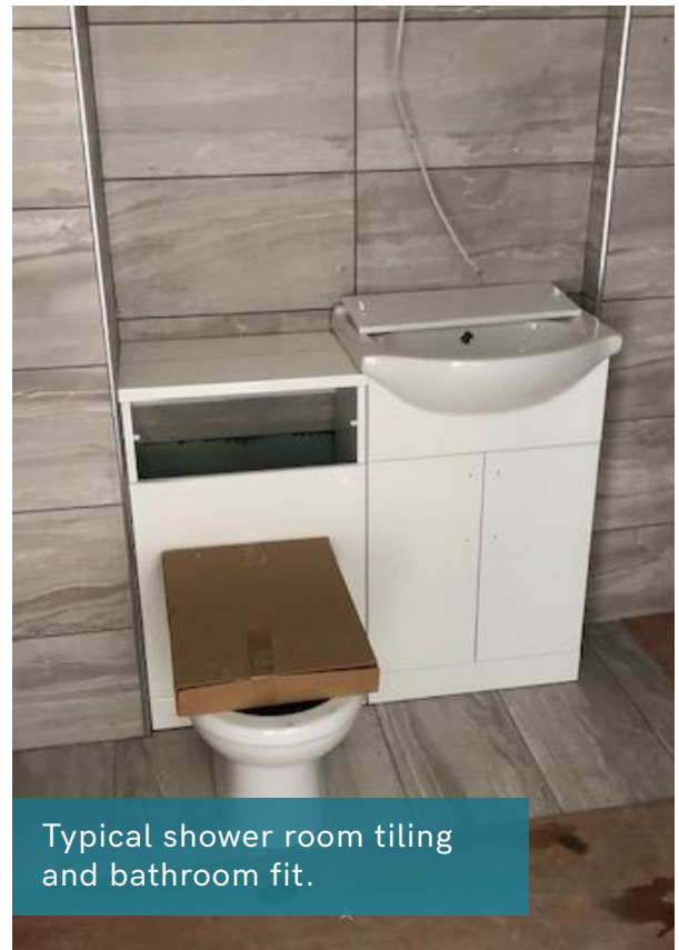
Typical shower room tiling and bathroom fit.