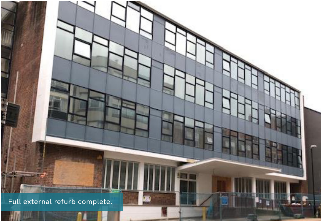
Full external refurb complete.