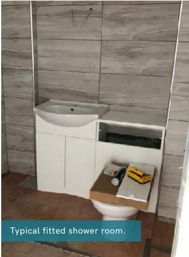
Typical fitted shower room.