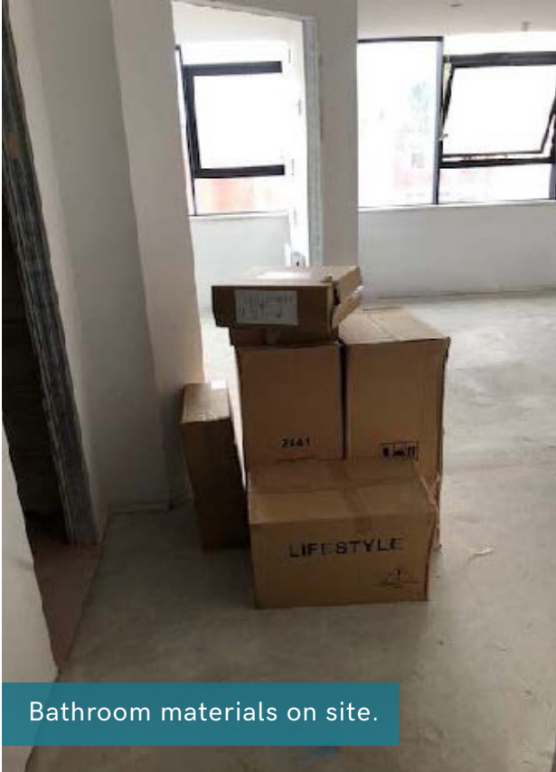
Bathroom materials on site.