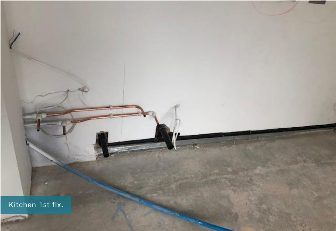
Kitchen 1st fix.