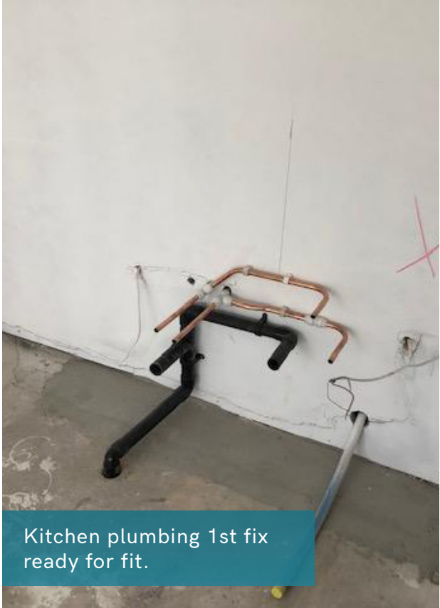
Kitchen plumbing 1st fix ready for fit.