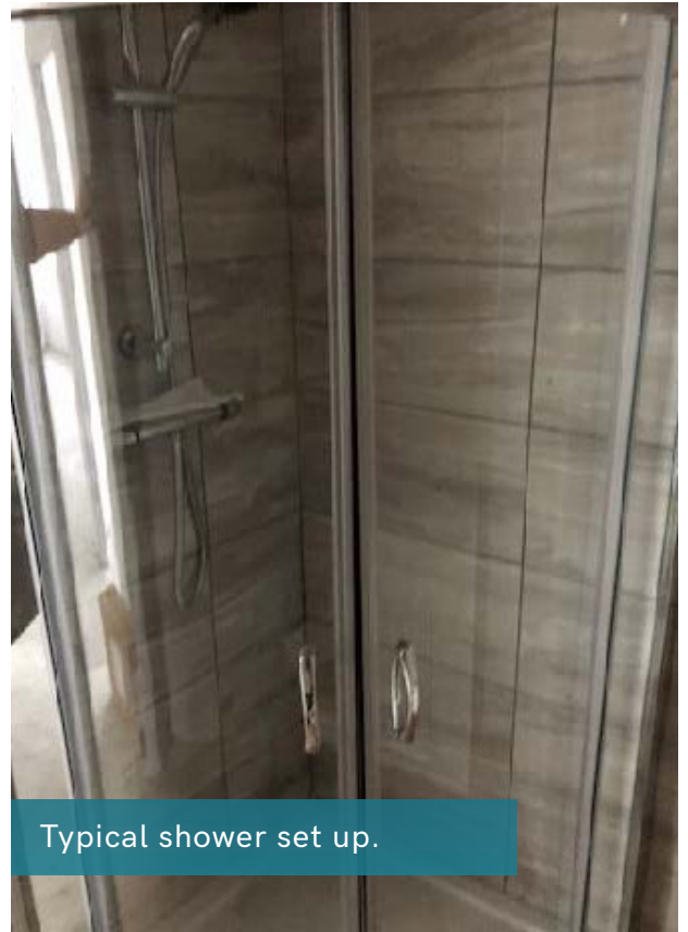
Typical shower set up.