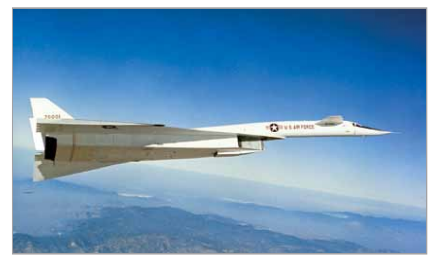
PHOTO: The XB-70 Valkyrie bomber prototype achieved speeds above Mach 3 (three times the speed of sound).