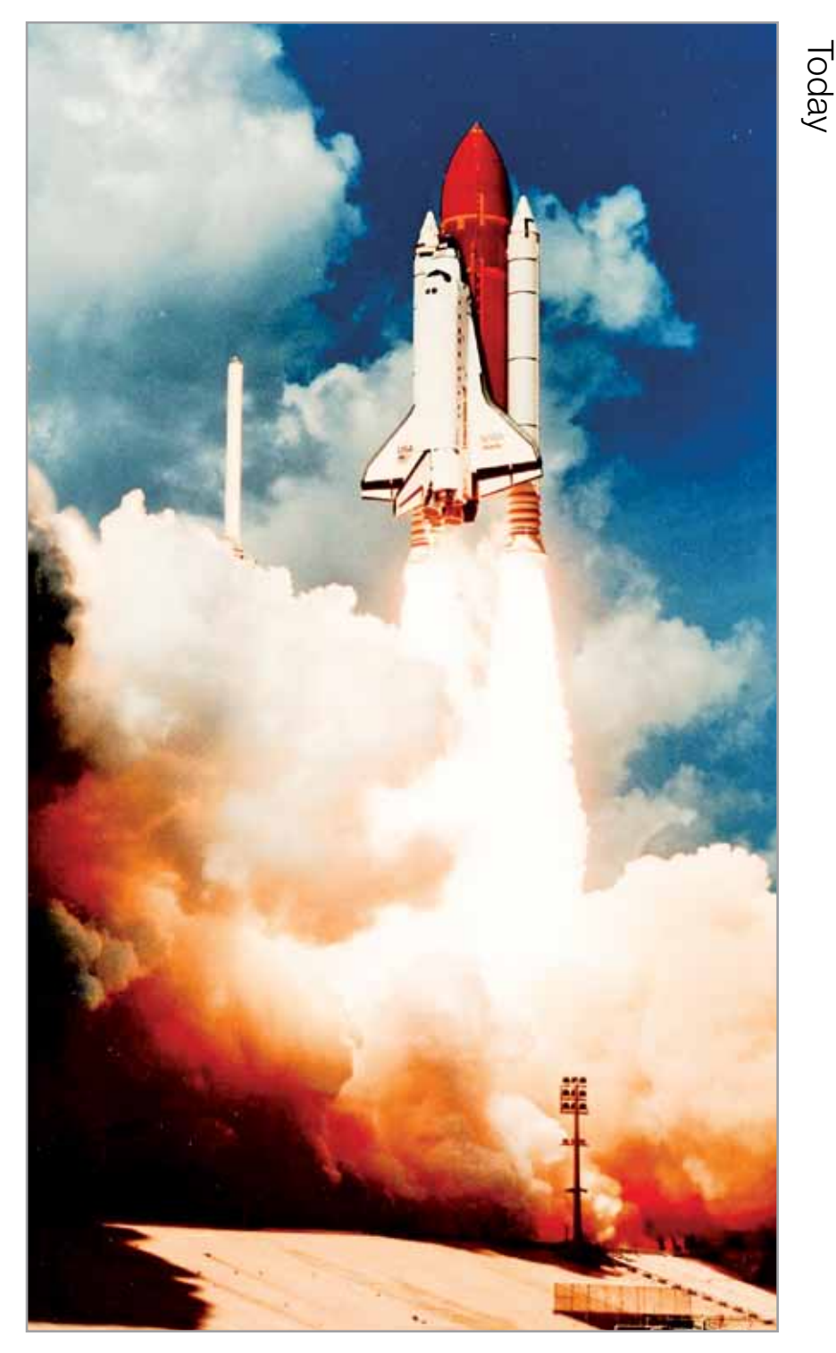
PHOTO: The legacy of North American Aviation continues with the space shuttle.

In 1967, North American Aviation merged with Rockwell Standard, creating North American Rockwell. To enhance its international identity, in 1973 North American Rockwell was renamed Rockwell International. It ultimately became part of Boeing when the aerospace and defense segment of Rockwell International was purchased by the company in December 1996.