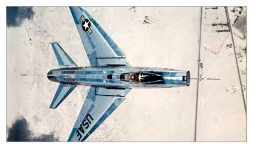
PHOTO: The F-100 Super Sabre was the first production airplane to fly at supersonic speed in level flight.