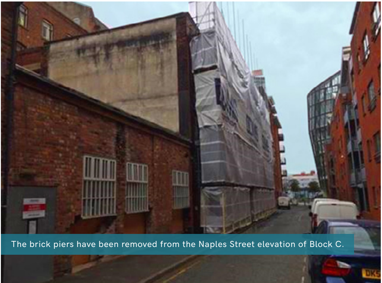
The brick piers have been removed from the Naples Street elevation of Block C.