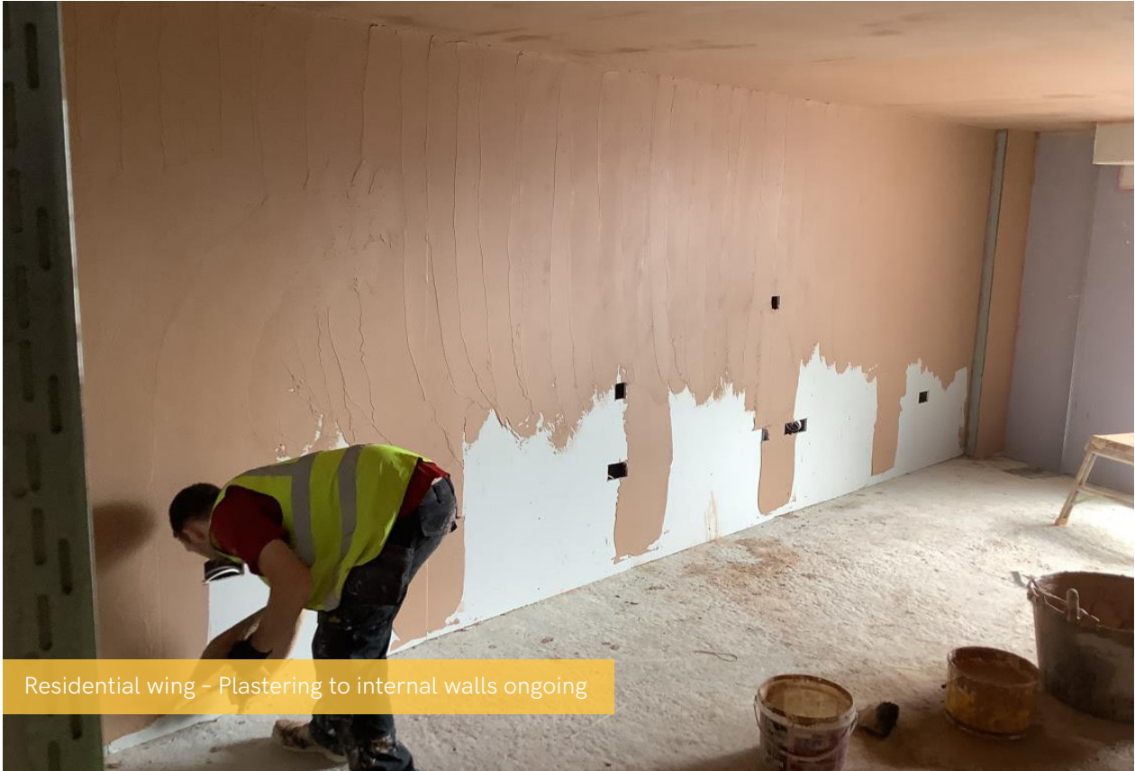
Residential wing – Plastering to internal walls ongoing