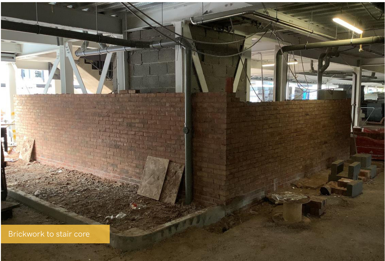
Brickwork to stair core