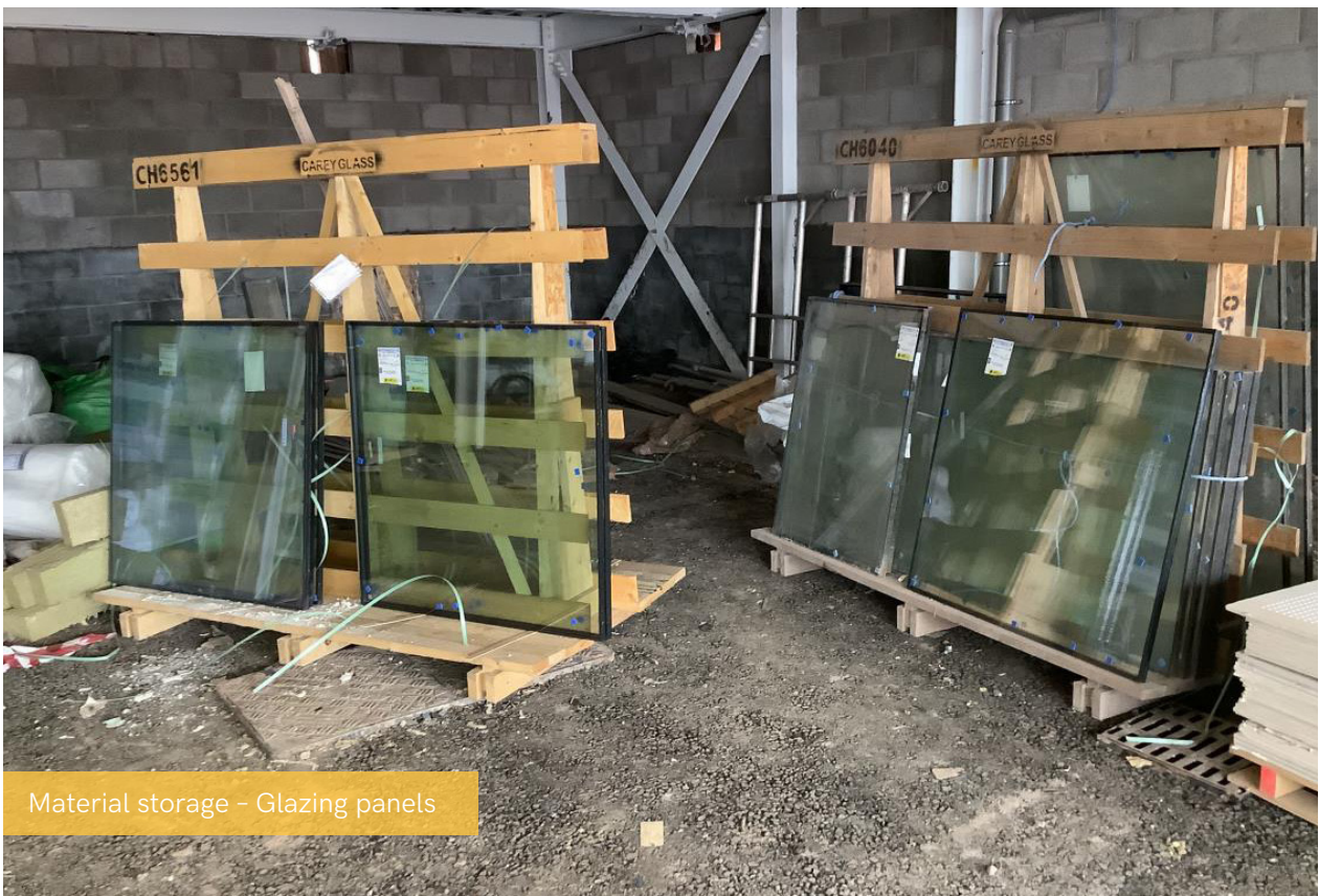
Material storage – Glazing panels