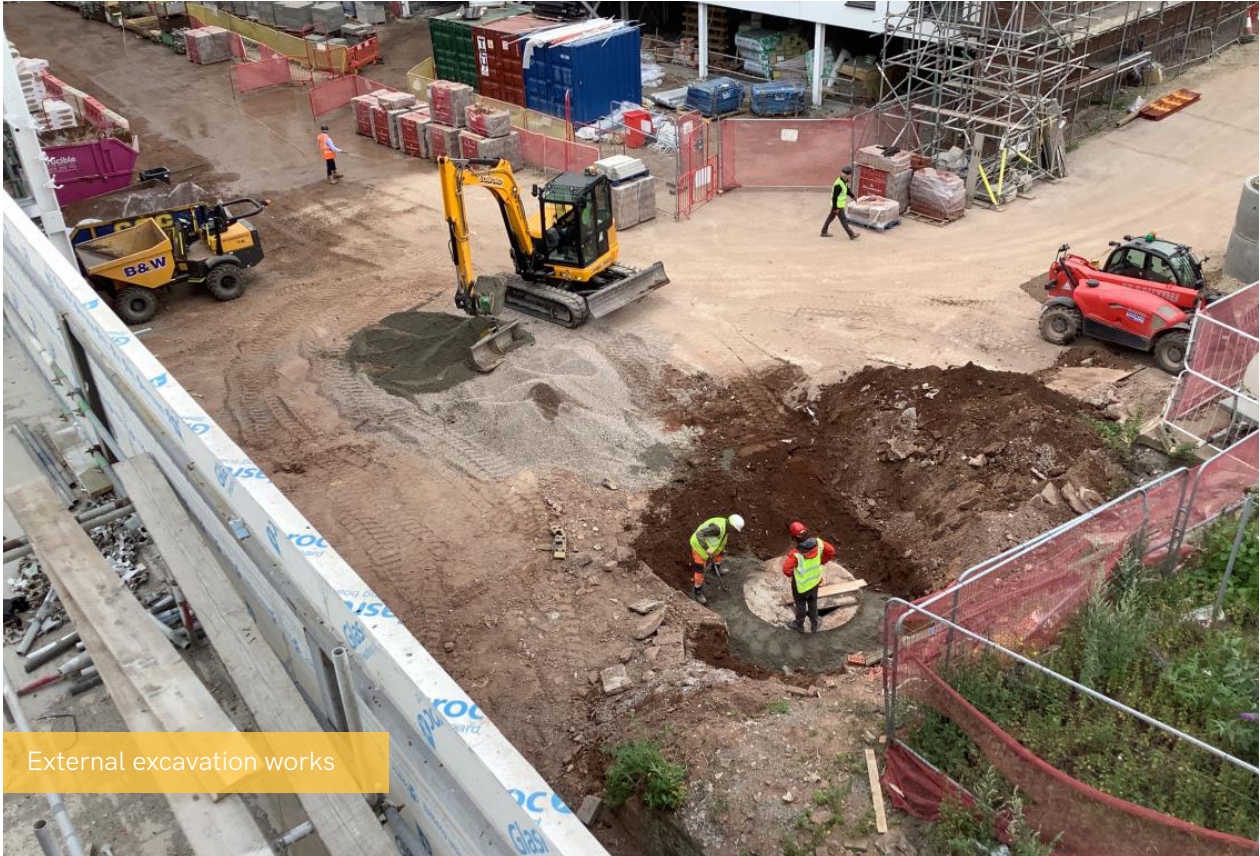
External excavation works