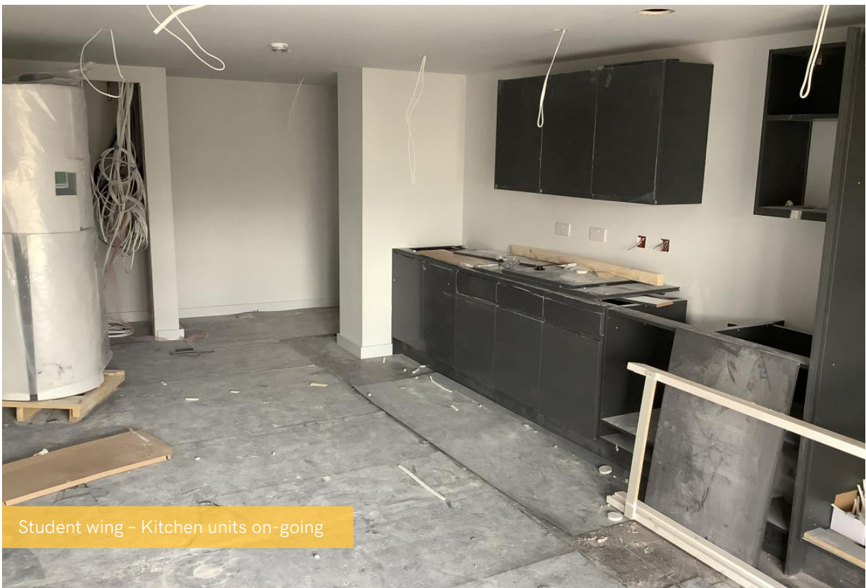
Student wing - Kitchen units on-going