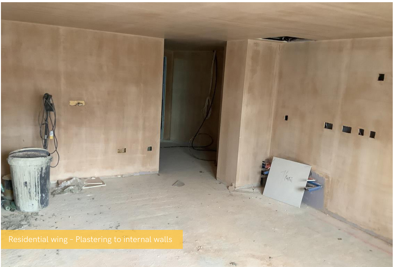
Residential wing – Plastering to internal walls