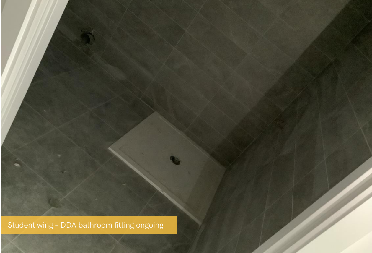
Student wing - DDA bathroom fitting ongoing