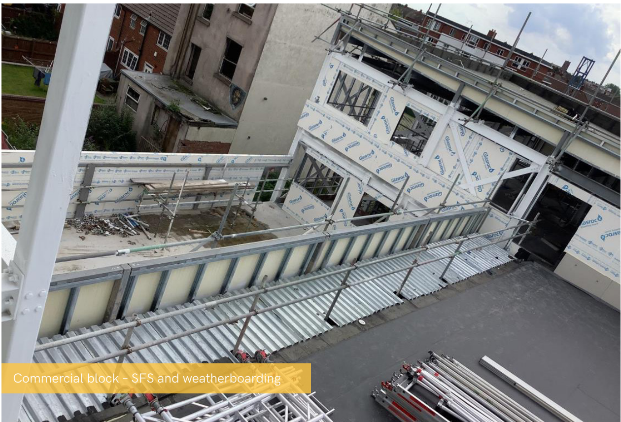
Commercial block – SFS and weatherboarding