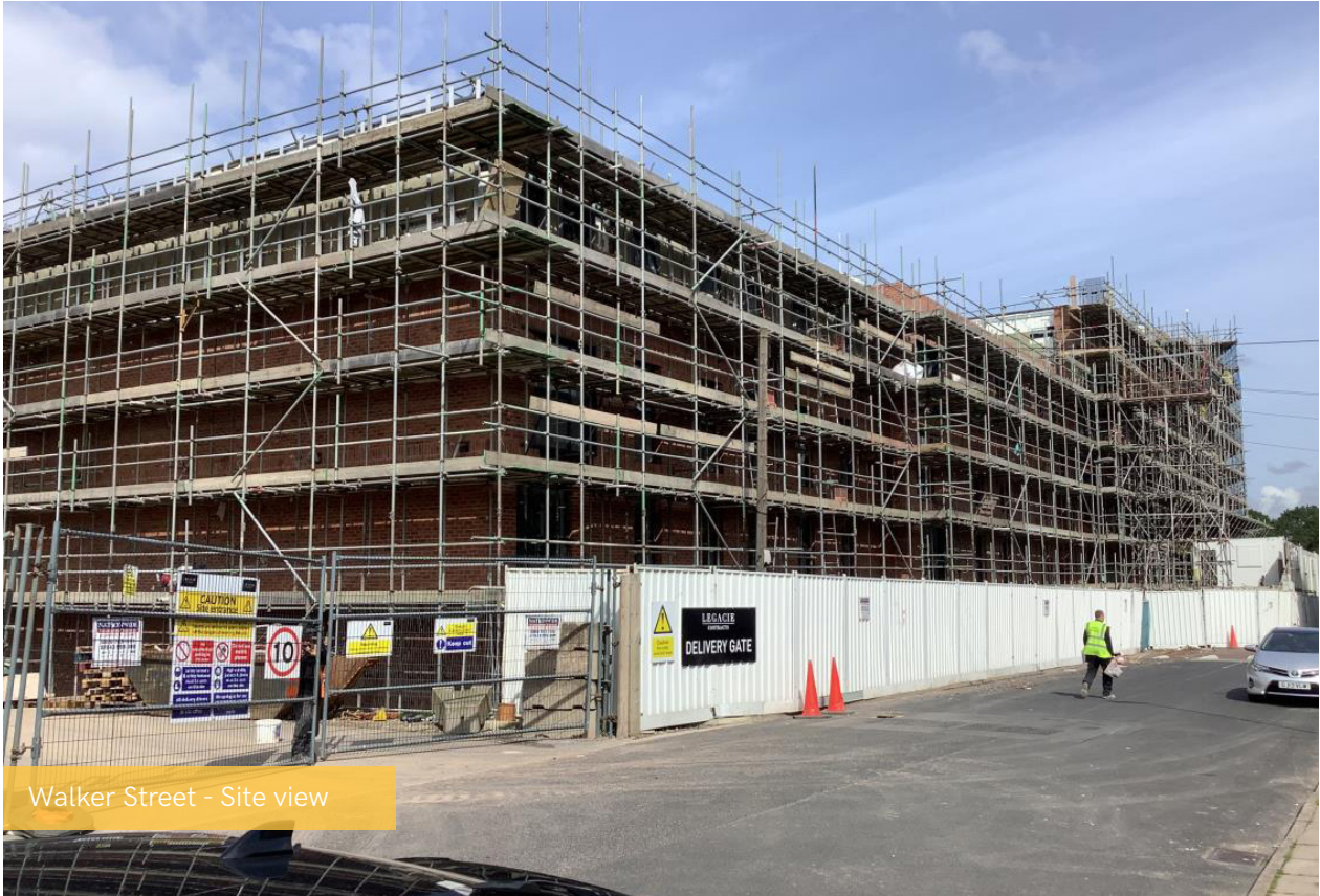
Walker Street - Site view