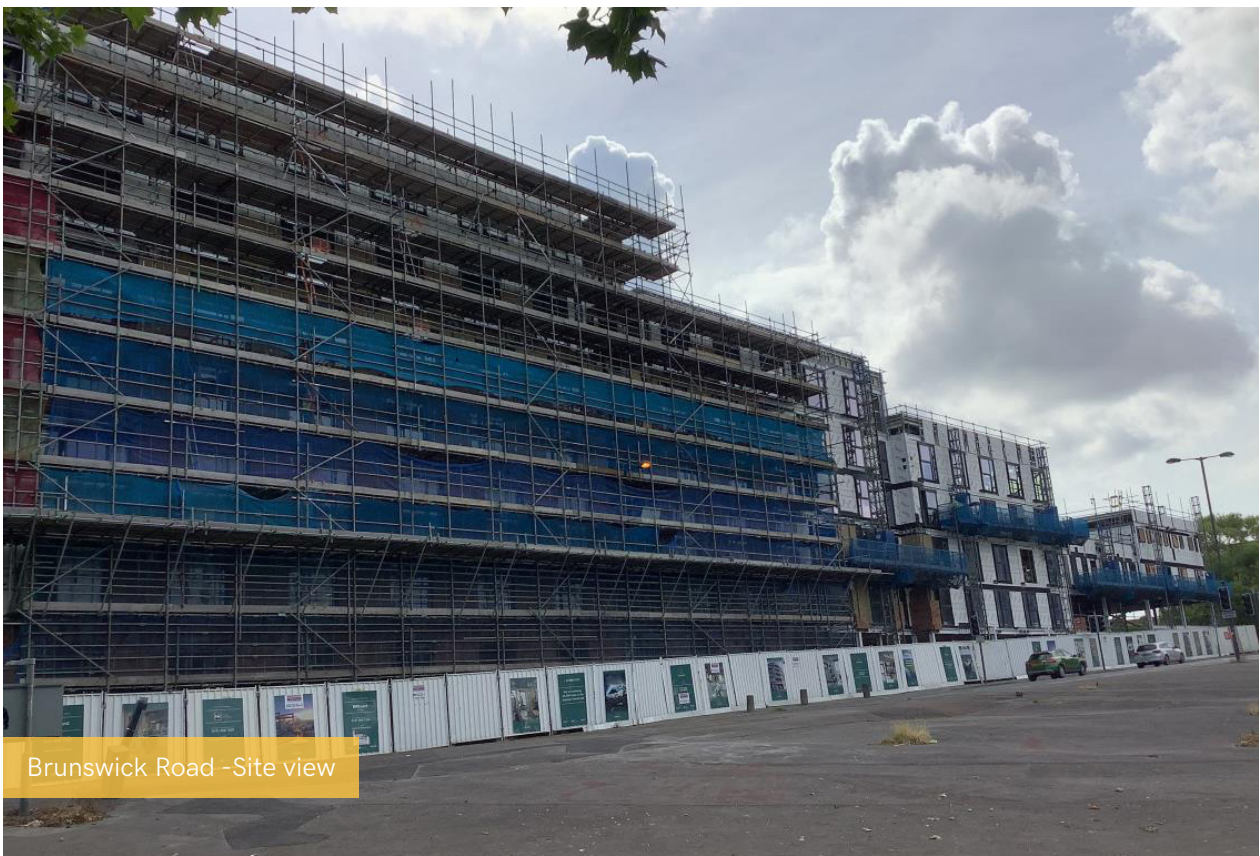
Brunswick Road - Site view