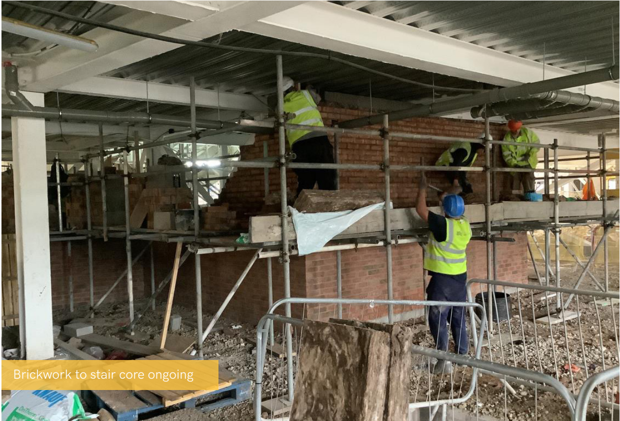
Brickwork to stair core ongoing