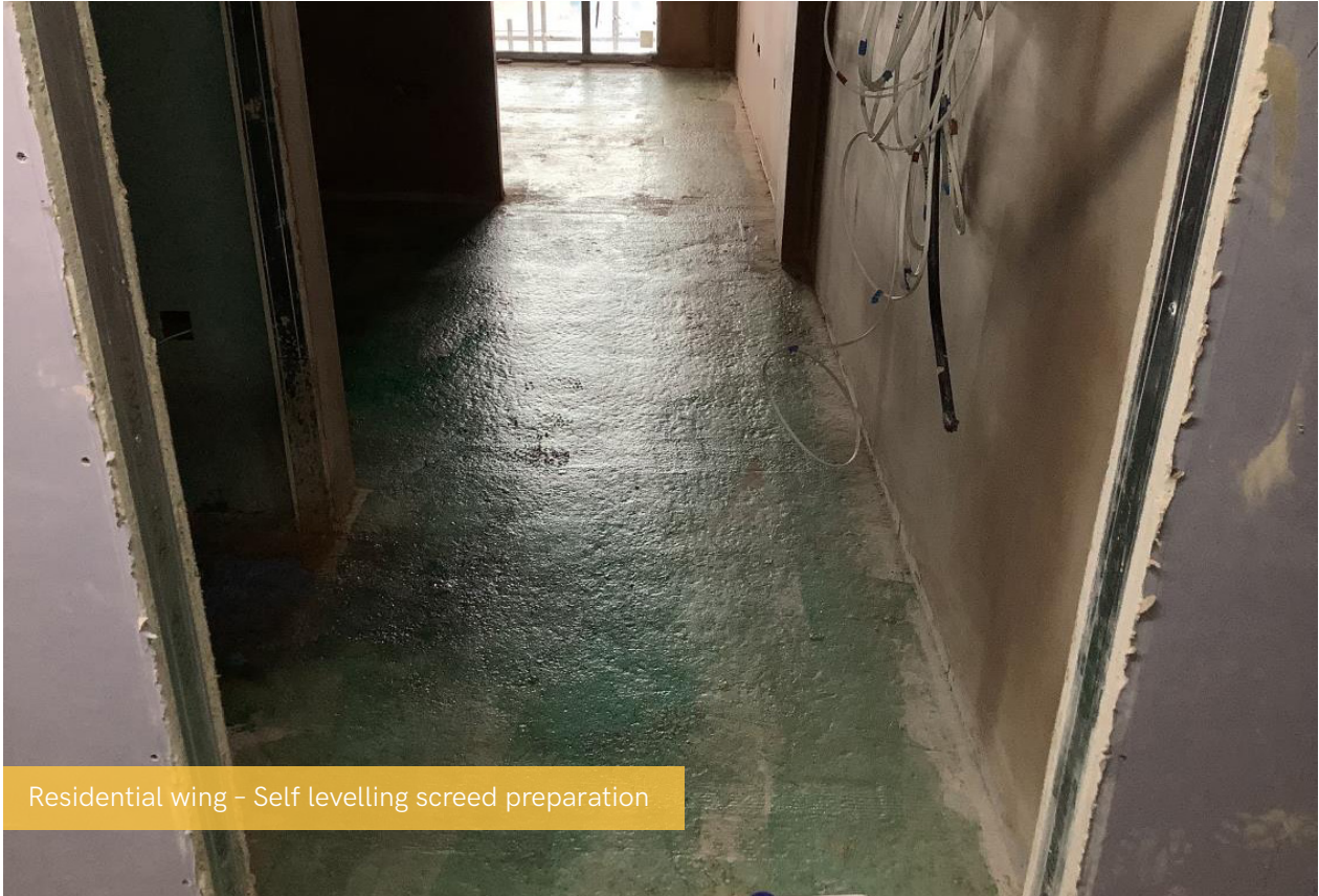
Residential wing – Self levelling screed preparation