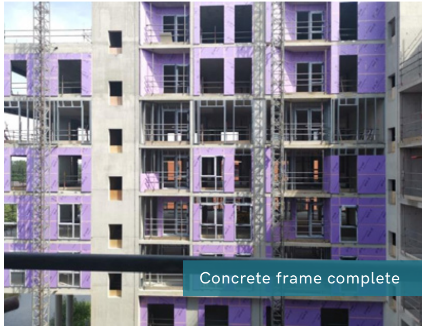
Concrete frame complete