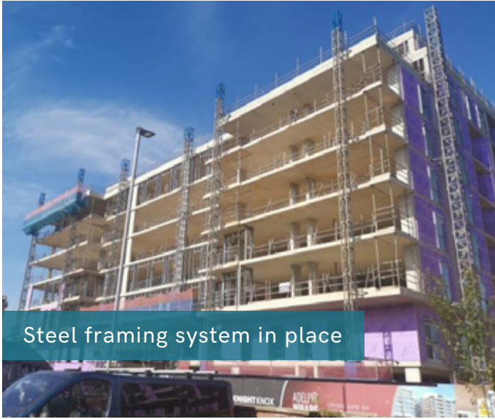
Steel framing system in place