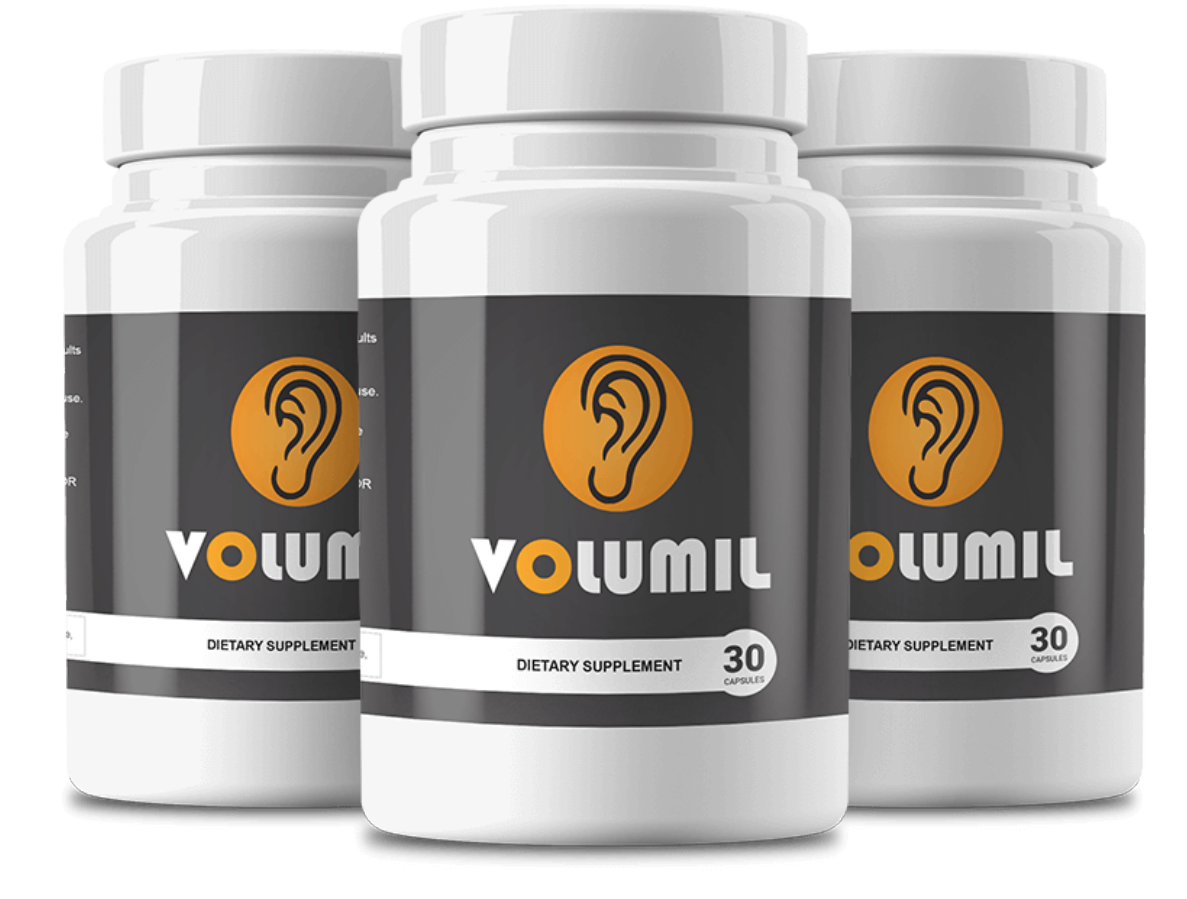
CLICK HERE TO CHECK DISCOUNTED PRICE (24HRS LIMITED OFFER)

Here we are talking about a very crucial disease, that is related to ear. In this disease the man loses his hearing capacity. Mostly this problem occurs because of increasing age but in some cases this problem takes place from the beginning of life. Here is a special supplement for you, which works to improve the listening capacity. Volumil Hearing Loss is the product we are giving information about. Volumil Reviews by the experts are very good.