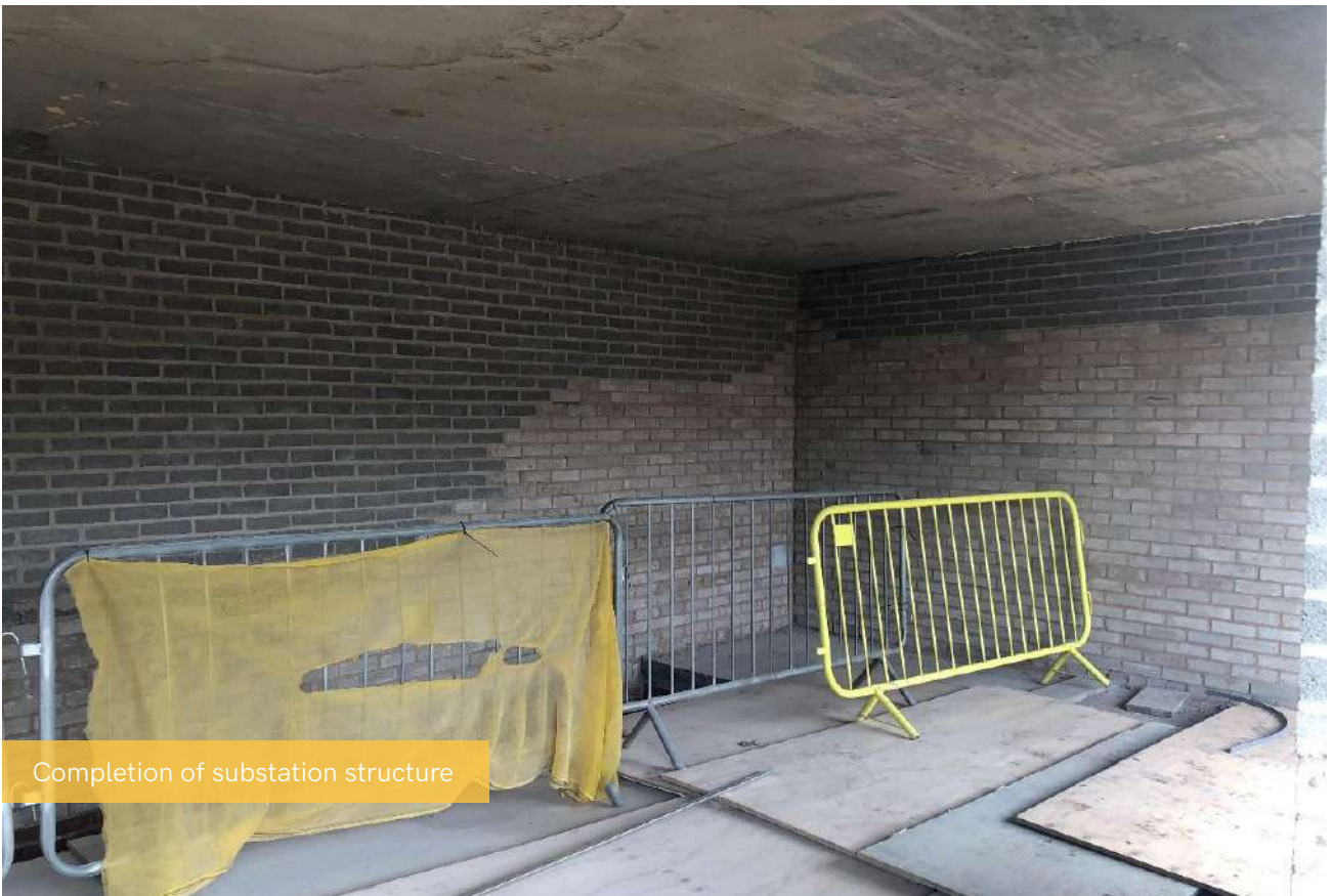
Completion of substation structure