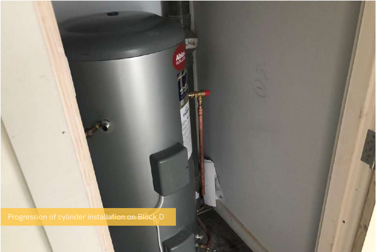
Progression of cylinder installation on Block D