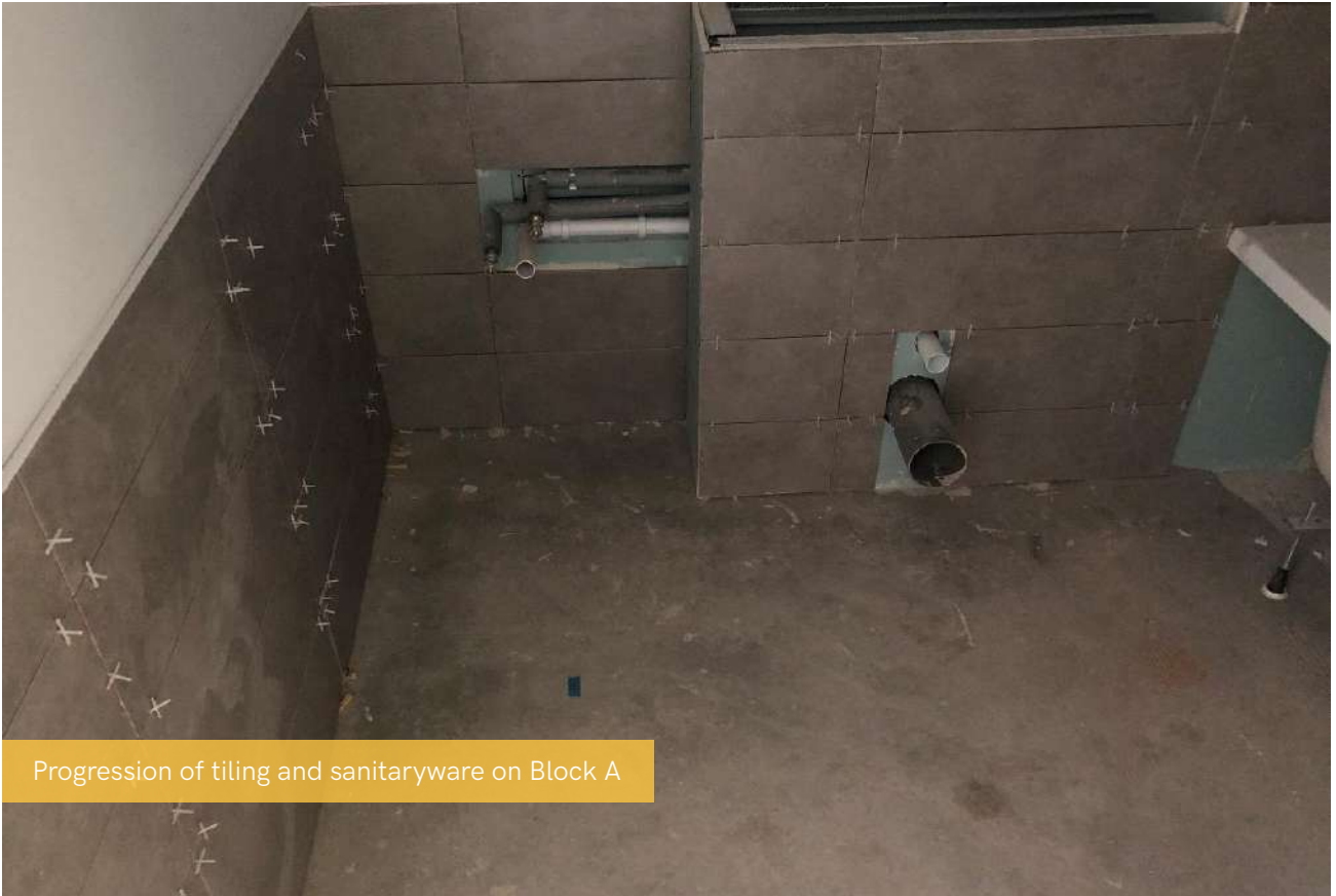
Progression of tiling and sanitaryware on Block A