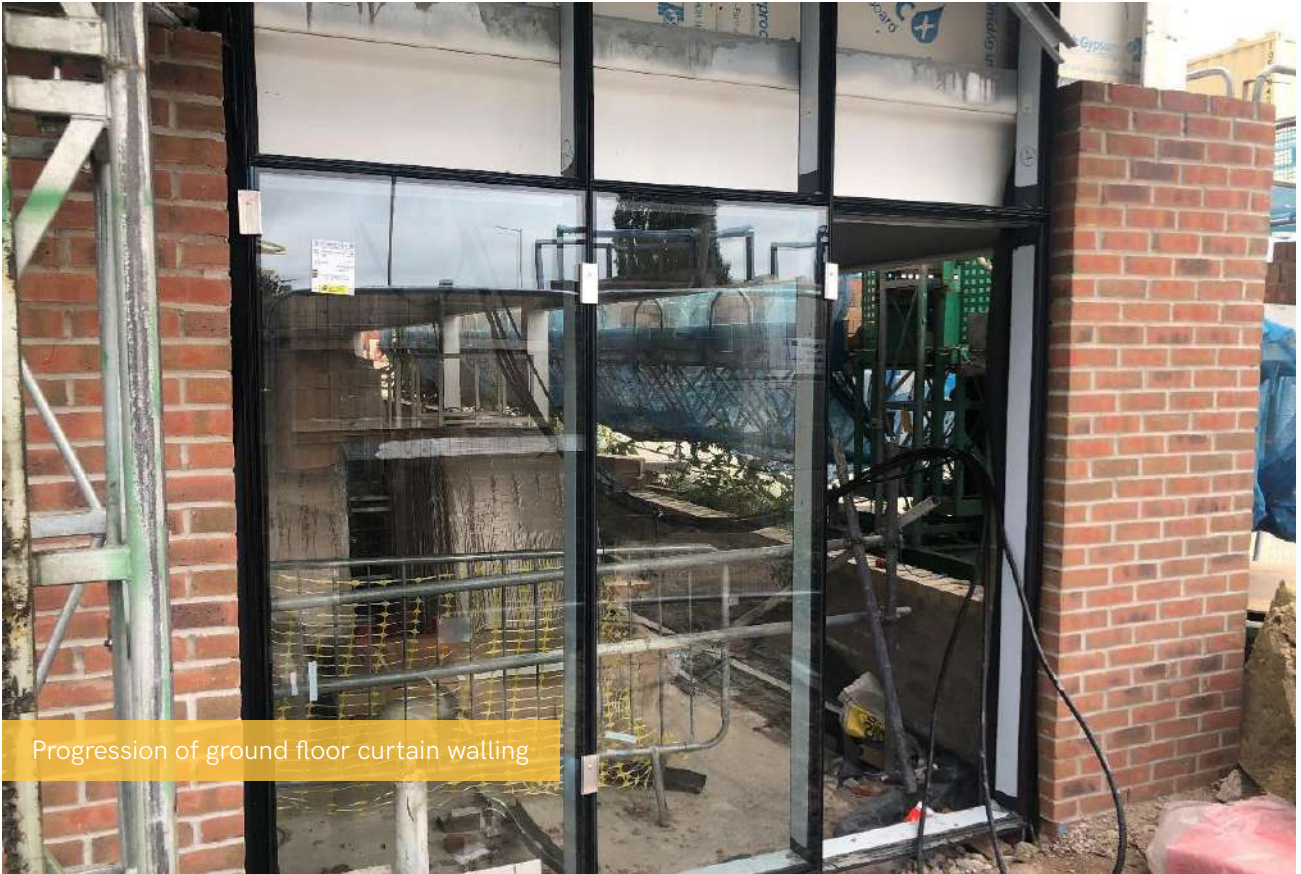
Progression of ground floor curtain walling