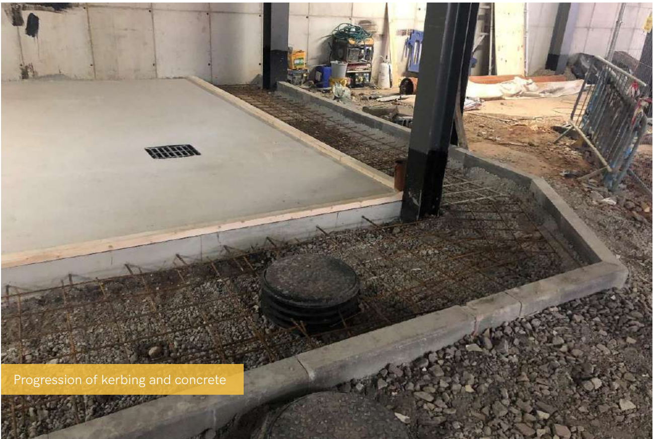
Progression of kerbing and concrete