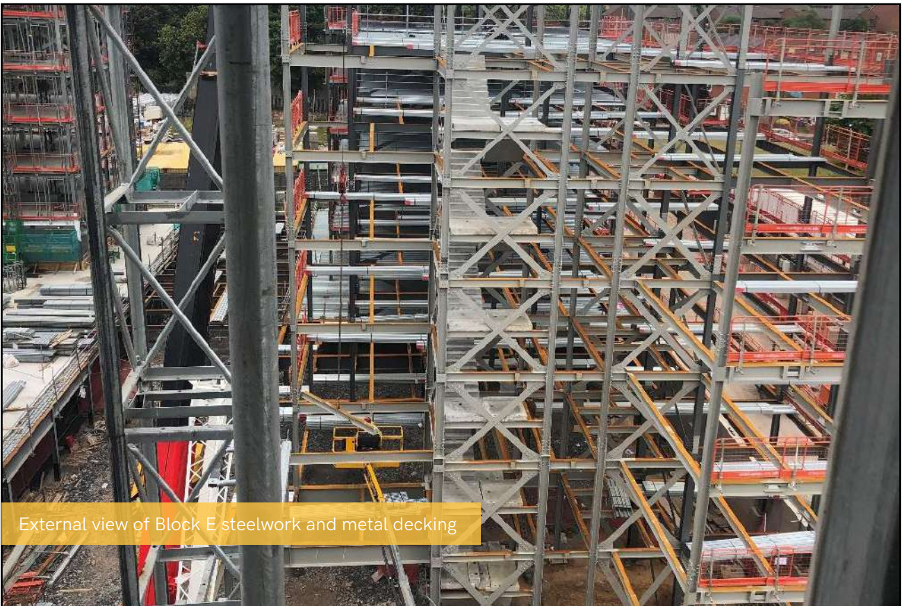
External view of Block E steelwork and metal decking