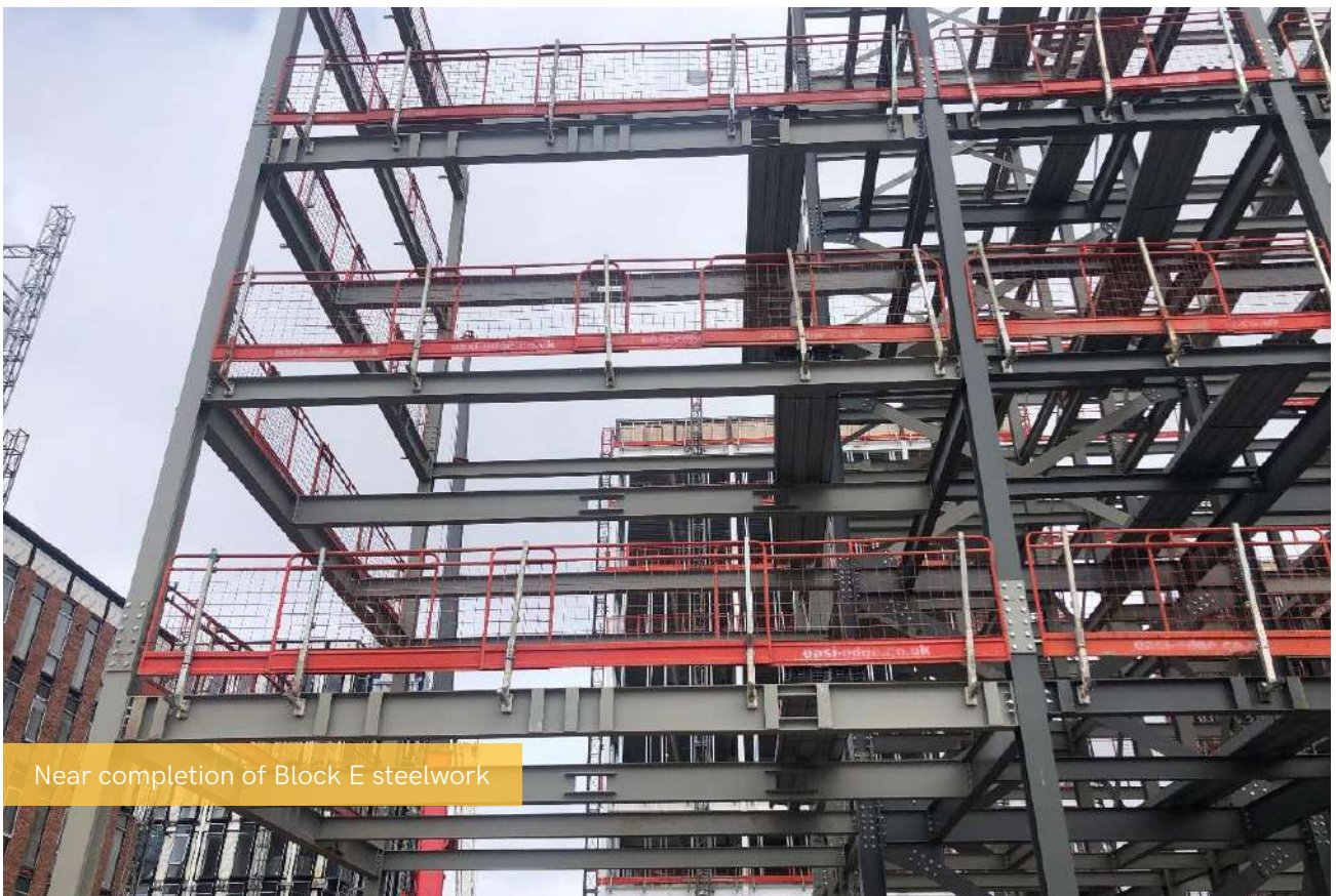
Near completion of Block E steelwork