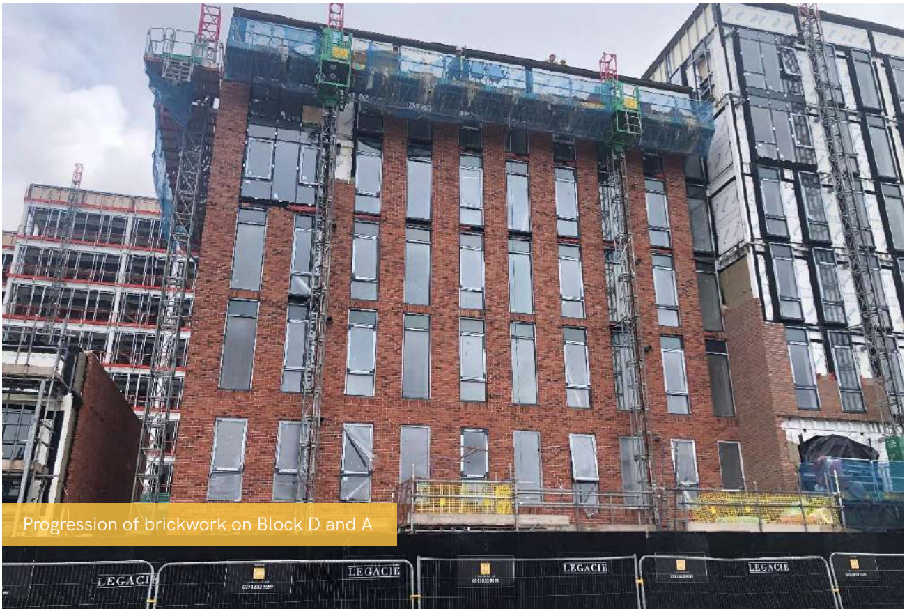
Progression of brickwork on Block D and A