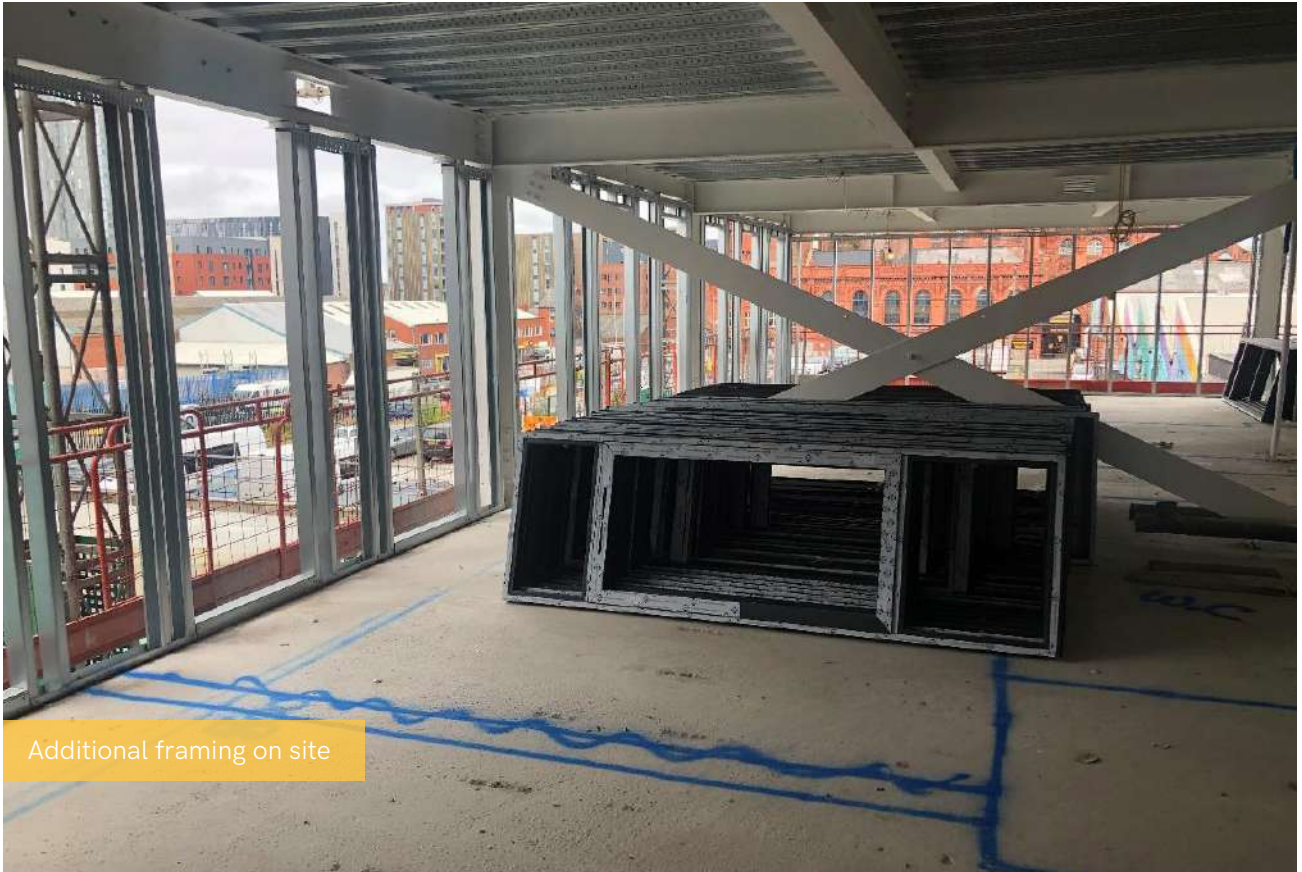
Additional framing on site