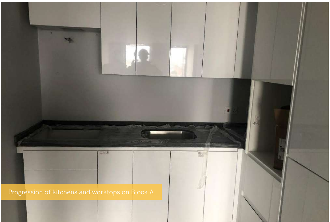
Progression of kitchens and worktops on Block A