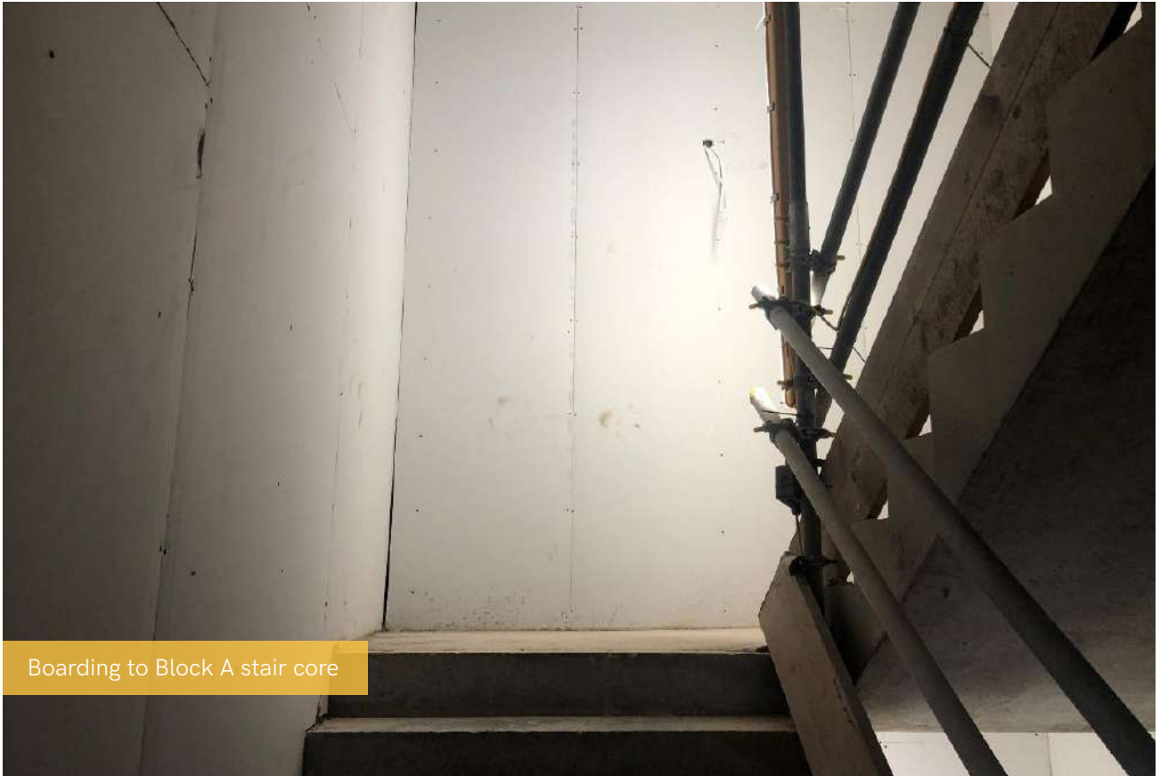
Boarding to Block A stair core