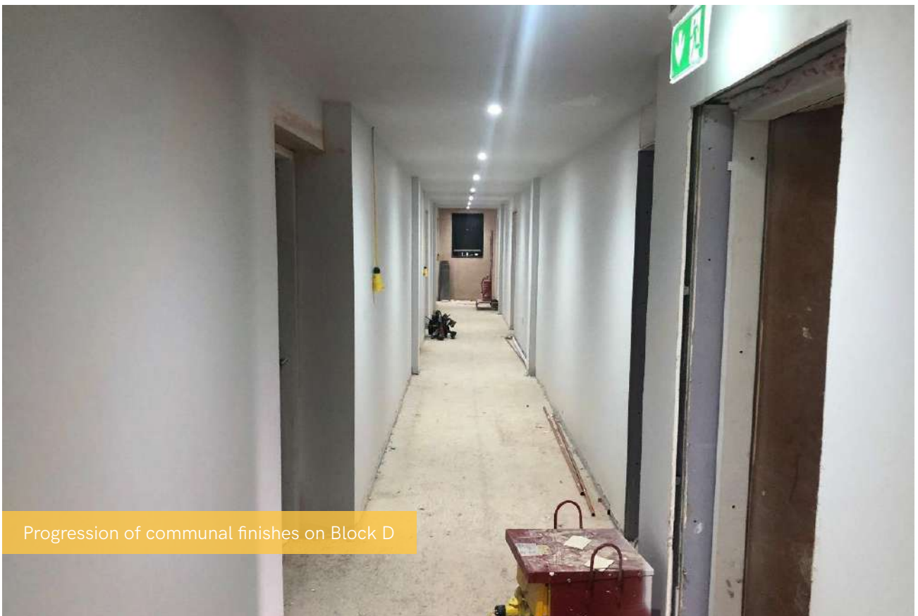
Progression of communal finishes on Block D