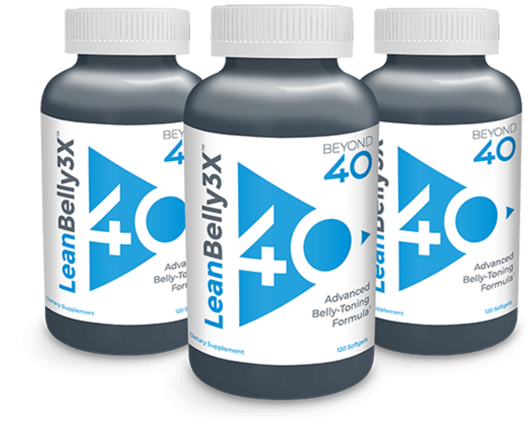
Beyond 40 Lean Belly 3X Ingredients

Beyond 40 Lean Belly is an advanced formula for melting fat from the body. This supplement helps to support improvement in health and also works in the activity of the metabolic system. Beyond 40 Lean Belly Ingredients works on storing fat, it is effective to remove extra calories and fat from the body. Lean Belly 3XTM is created by Beyond 40.